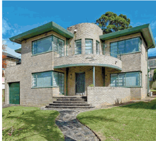
This Art Deco classic at 26 Clements St in Russell Lea sold for $5.15 million.

THE DESIGN OF THE HOUSE MADE IT AN EXTRA SPECIAL SALE FOR THE AGENTS, WRITES OWEN ROBERTS