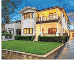
5 Francis St, Strathfield, sold for $3.4m.

Bidding for the property at 5 Francis St started at $2.8 million.