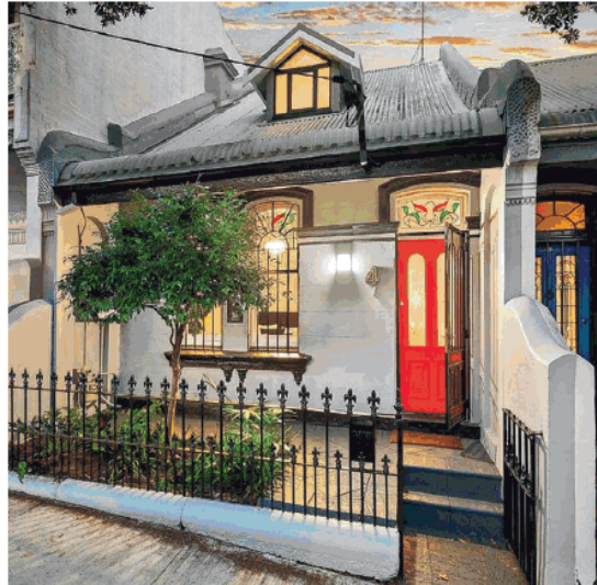
This attractive terrace at 4 Pine St in Newtown sold for $2.065 million.

ADRIAN SERENI & WARWICK WILLIAMS- WARWICK WILLIAMS REAL ESTATE”