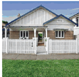
The facade of 22 Greenhills St, Croydon.