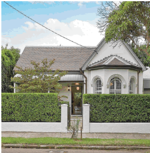
This home at 65 View St, Annandale, sold for $3.83 million.