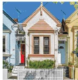
35 Campbell St, Newtown.

30s beat a young Newtown couple and three other registered parties in the heated bidding which started with him at $950,000 and finishing with $1000 bids, with both final parties stretching the budget.