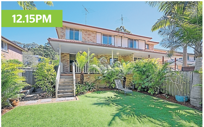
Frenchs Forest 8a Noorong Avenue $1.3 million - $1.4 million