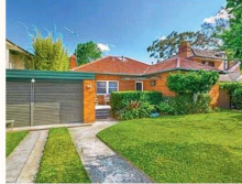
No. 66 Newton Rd, Strathfield.

The eventual winners were a young family who plan to occupy