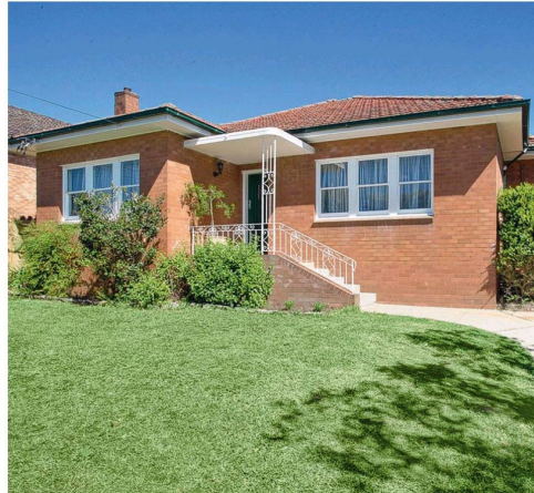
32 Wetherill St, Croydon, sold for $2 million.

CHRISTIAN ZIADE, BELLE PROPERTY - SURRY HILLS