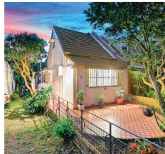
No. 10 Station St, Petersham.