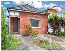
No. 5 Cecil St, Wareemba.

Exclusive Real Estate Concord, saw 59 groups through the 5 Cecil St home throughout the campaign, and issued 17 contracts.