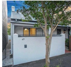
No. 49 Pearl St, Newtown.

"This property received quite a bit of interest as its in the entry level two-bedroom house range."