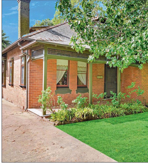
31 Wyatt Ave, Burwood, sold at auction for $5.71 million.