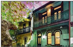
7 Holdsworth St, Newtown