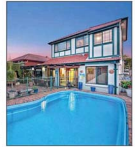
13 Llangollan Ave, Enfield.

Find us on Facebook at Inner West Courier and on Twitter @InnerWestNews