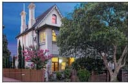
74 Cambridge St, Stanmore

"The positive thing is they've got a better understanding of the market so they're more confident in making a decision."