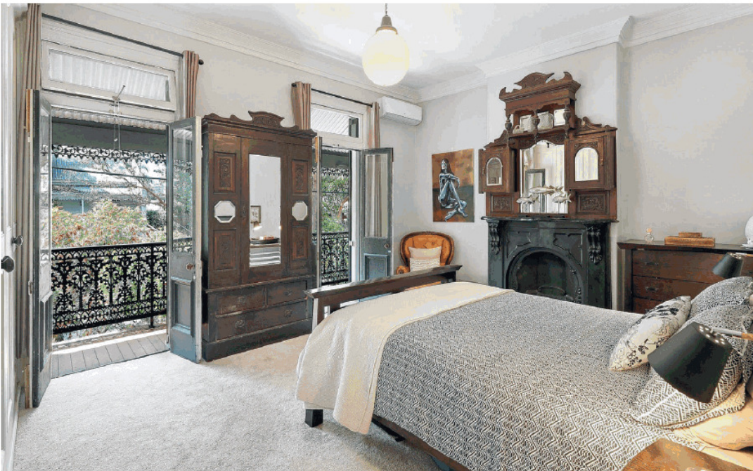
44 INNER WEST COURIER INNER CITY, Tuesday, November 7, 2017