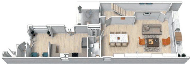
Produced by DIAKRIT